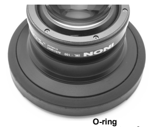
O-ring contact surface